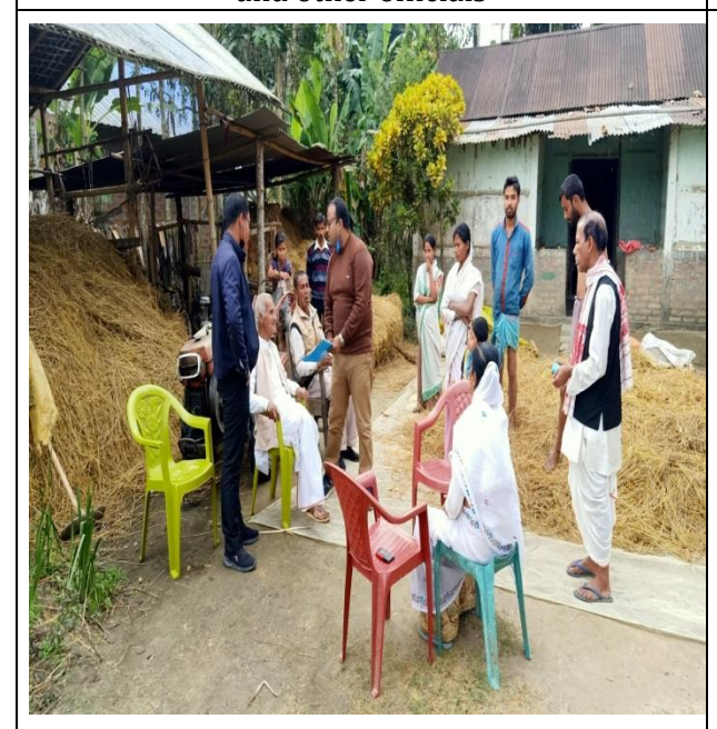
Photo Plate-3 One-time financial assistance paid to four non-titleholders