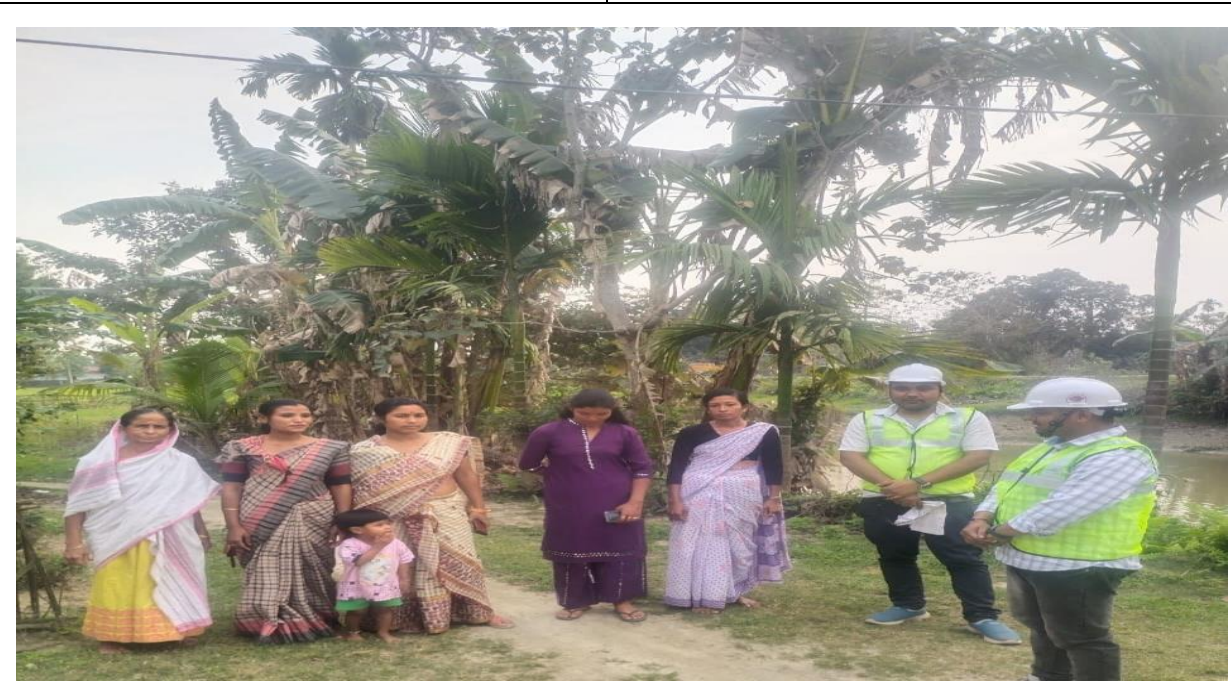
Photo Plate-11 Public consultation with females near Bihpuria substation