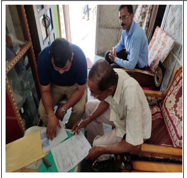
Photo Plate-5 Consent and Signatures taken from non-titleholders by PMU/PIU officials